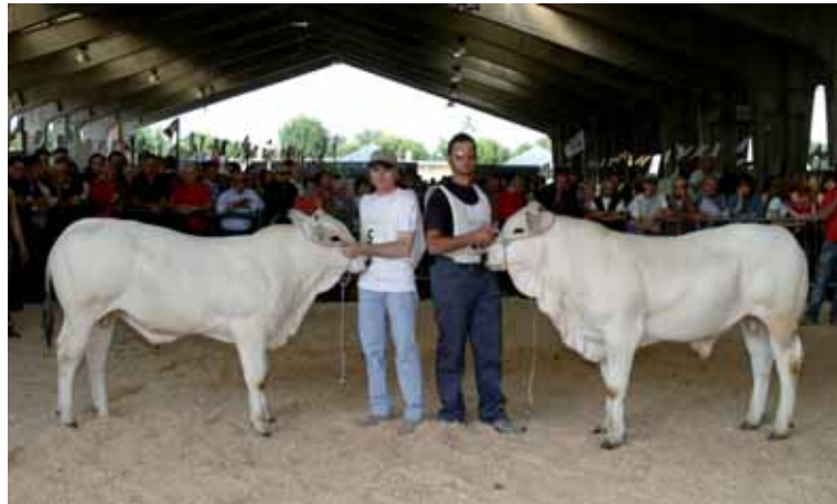
From the right: Senato and Soffio, Junior Champion and Reserve Champion

We must also note Erode's role as a driving force in this event, literally stealing the show and rightfully entering the Hall of Fame of the great sires that the Marchigiana has always represented.