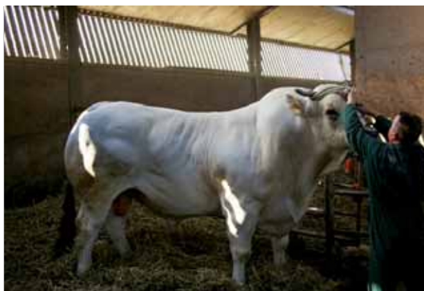
Palio in his new stall

The Ercoli farm exported a yellow-ribbon show heifer, while the Minutelli farm sent a large number of young grazing farm-reared heifers, daughters of sire Leonetoro, tested at the Genetic Centre of Perugia.