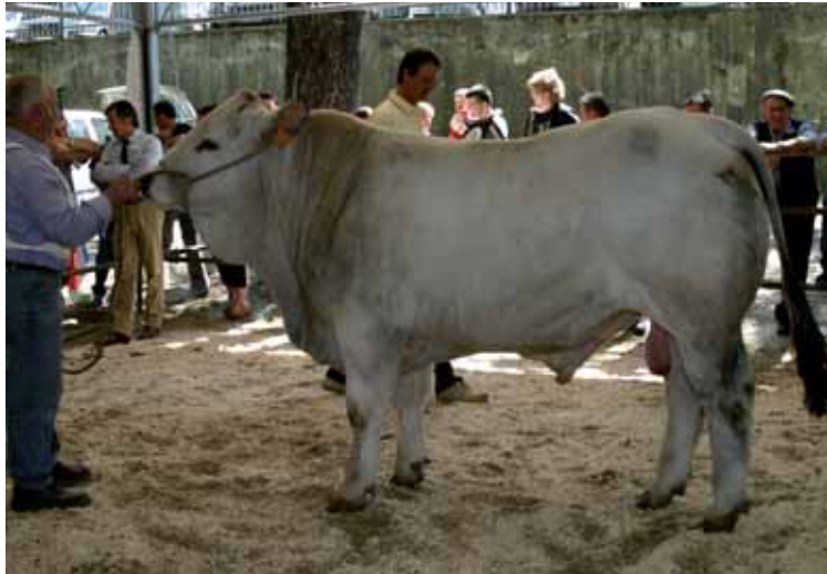
Serpico – Az. Agr. Poggioli di Fiumicello, Junior Champion