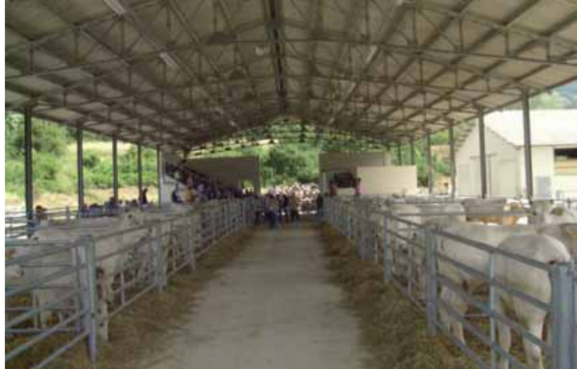
Panorama of the Heifer Centre structures at Ponte Presale