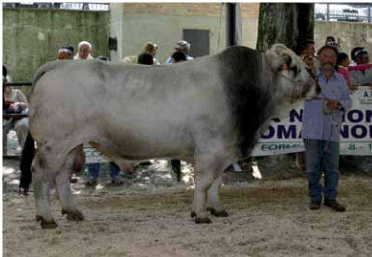
La Viola Orto – Az. Agr. La Viola, Senior Champion