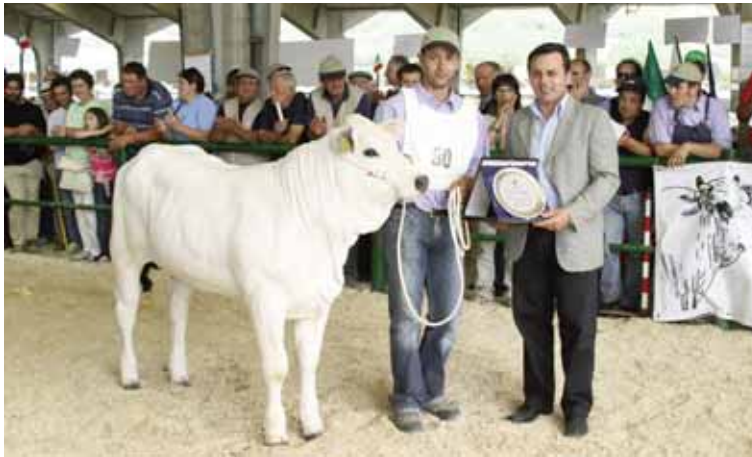
Santa – Az. Agr. "La Bigotta", Junior Reserve Show Championess