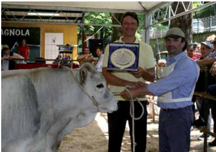
The award to Stock della Radice from Az. Agr. Stoppa Renato, Junior Reserve Champion

- Serpico, sired by V.U. Navaho and presented by the Poggioli di Fiumicello; Serpico was also the