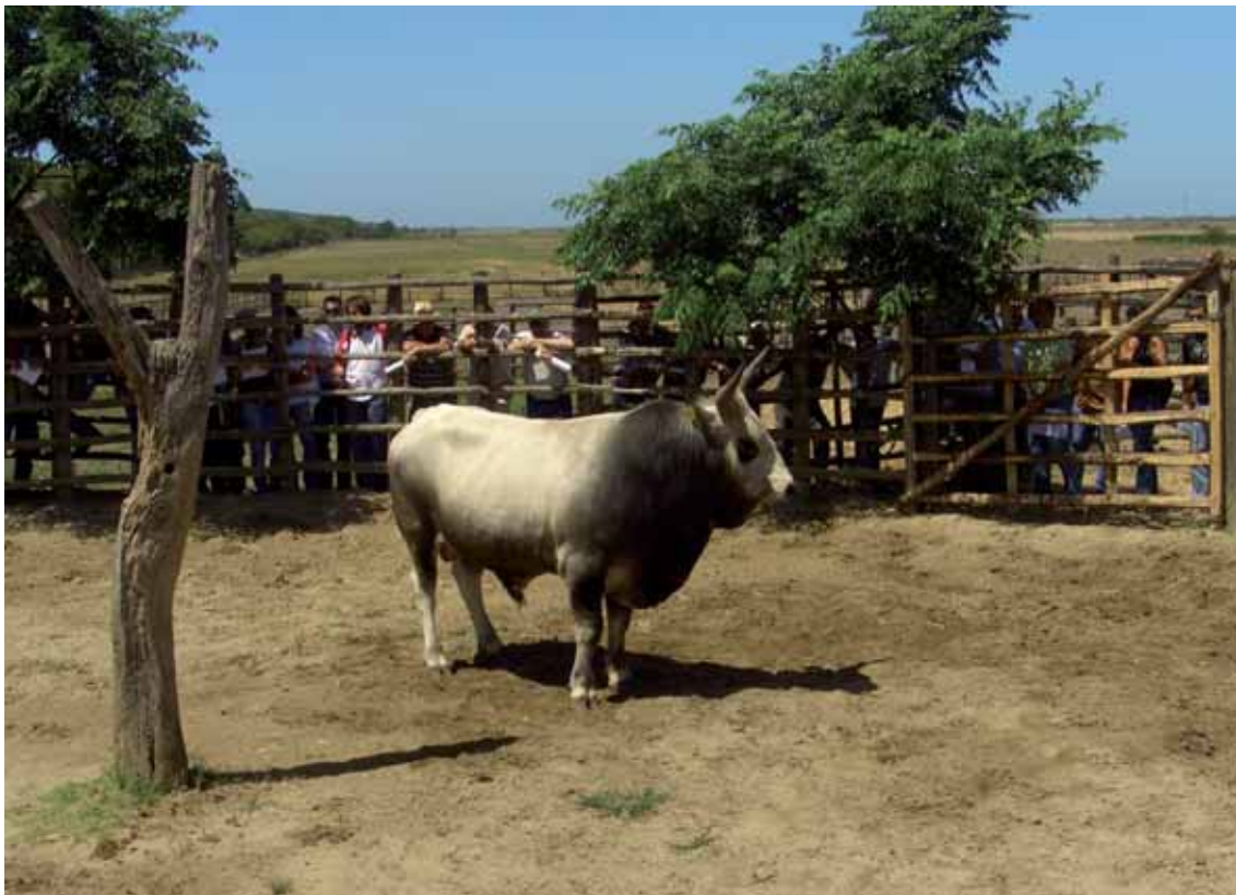
One of the bull calves on the auction block at the Alberese genetic centre

Another good performance was that of “Sero”, an extremely valid son of Olimpico from the Castelporziano Estate, the only one of the lot to have received a score of 88 points in the morphological evaluation and