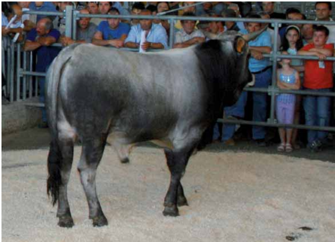
A moment during the auction at the Laurenzana genetic centre

All the lots presented were sold and, among these, it should be pointed out that two animals reached the price of € 4,000, while "Silvano", an extremely vigorous and correct animal from the Canio Perrone farm in Potenza, was won for the amazing figure of € 4,150 by the Sa.Ma.Do.Gi. farm of Bari. It is evident that, considering the genetic value of all the sires presented, and in particular for these that achieved record prices, the interest of numerous breeders is starting to focus on, and their confidence is rising in, the work done by the ANABIC Selection Centre. This is even more evident considering that the auction starting price was relatively low, i.e. € 1,600. The first animal presented was "Seneca", an interesting son of Medi evaluated with a score of 85 points and an ADG of 1,471 g/da