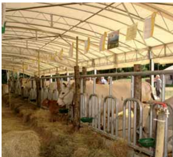
View of the animals on show

O n the occasion of the agricultural event of the Vomano Valley, organized and held from June 1st through 3rd, 2007 in the area adjacent to the Villa Vomano sports field, it was possible to admire the fine livestock specimens of the province of Teramo, called upon to show the potentials of the territory of Abruzzo in the livestock breeding sector.