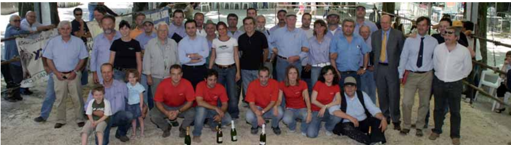
The technical staff and breeders at the show

In this relaxing atmosphere, the ceremony continued with the award of a plaque to each of the breeders to commemorate their participation. Group photos and a final toast cheerfully brought this successful show to a close. The show presented the breed at its best and allowed breeders to compare notes in a serene climate that was unquestionably the most pleasant aspect of the 2007 Romagnola National Show.